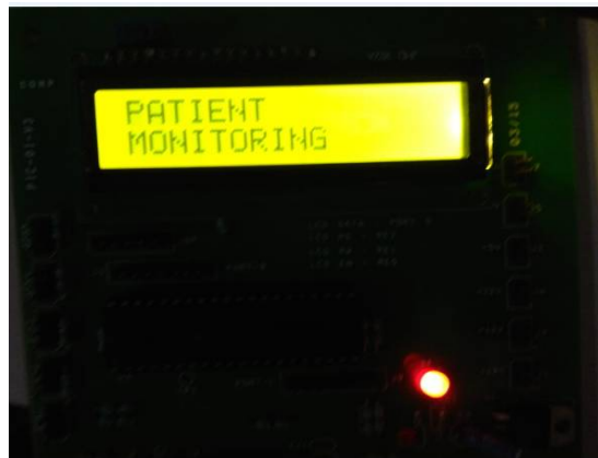
Fig 1.1-Patient Monitoring