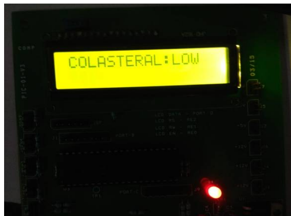
Fig 1.3-Cholesterol level monitoring